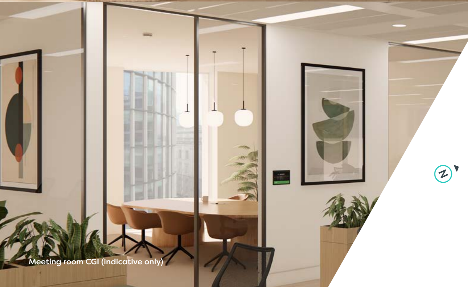
Meeting room CGI (indicative only)