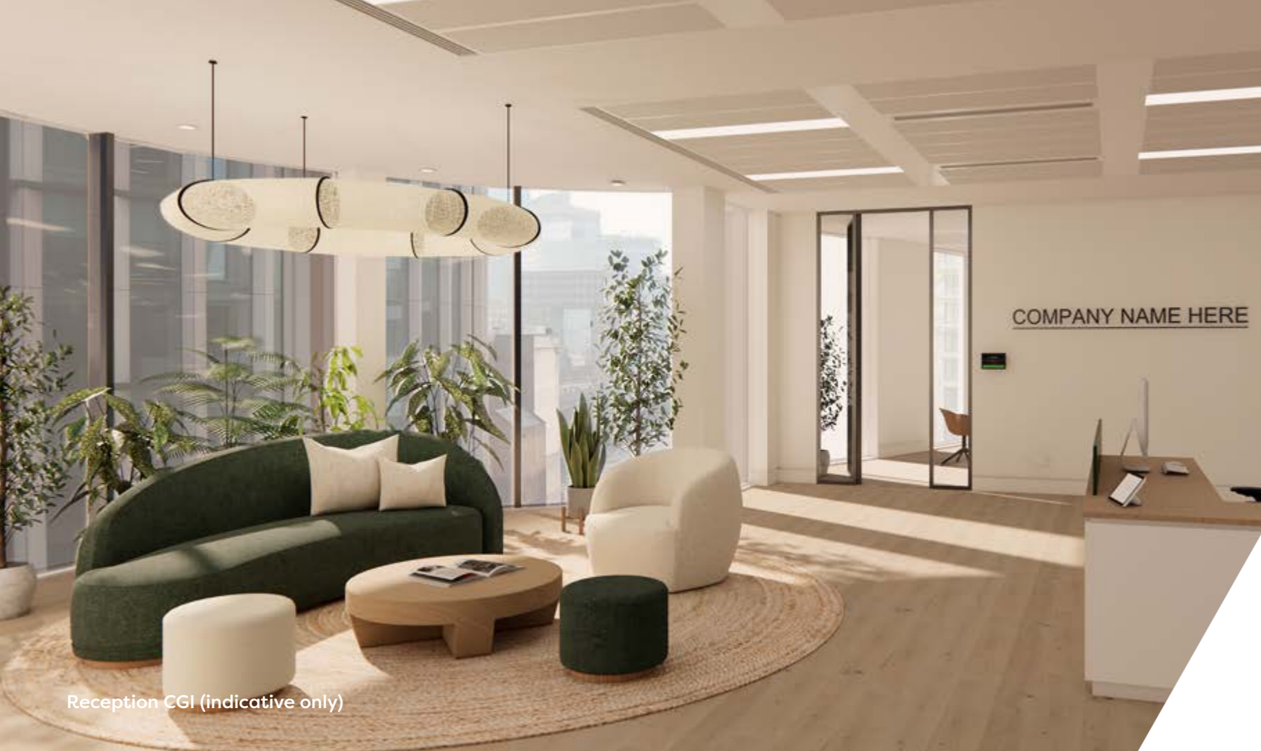
Reception CGI (indicative only)